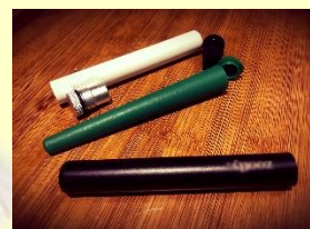
Fig 2 are metal or toughened PVC holders to store your 'J' just in case you get paper.

your needs. Fig 1 shows of the glass and wood range that would suit your storage requirements.